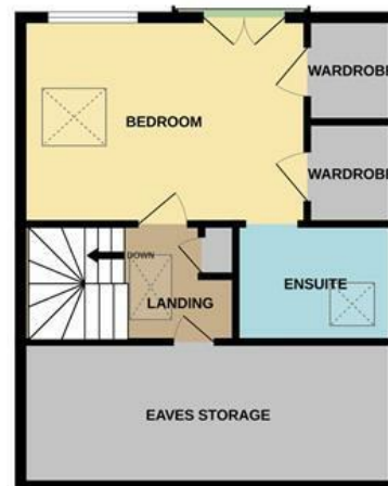
2ND FLOOR 466 sq.ft. (43.3 sq.m.) approx.