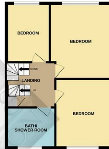
1ST FLOOR 512 sq.ft. (47.6 sq.m.) approx.